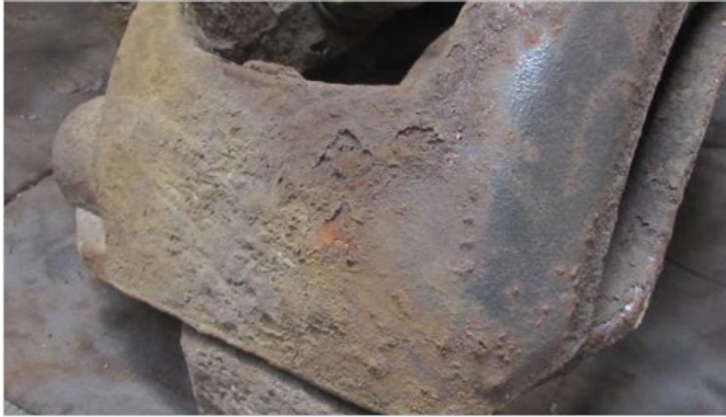
Surface corrosion which doesn't have impact on surface, no pitting allowed (carrier, frame)