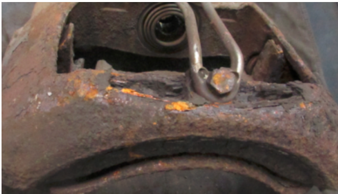
Pitting corrosion (structure of cast is degraded)