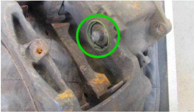
Cut adjusting screw