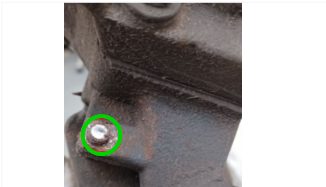
Cut adjusting screw (metal screw)