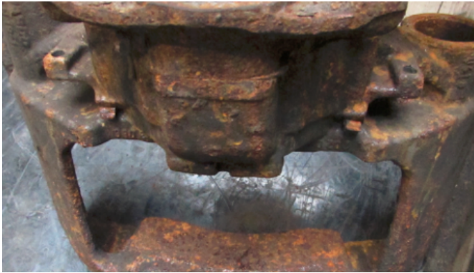
Pitting corrosion on frame (Not off-vehicle condition)