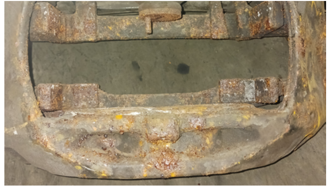
Pitting corrosion on carrier (Not off-vehicle condition)