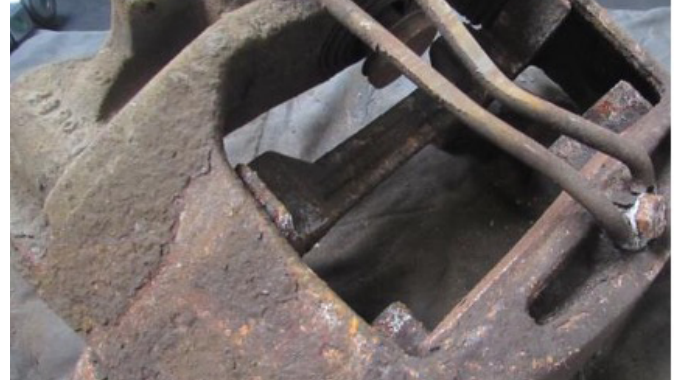
Surface corrosion which doesn't have impact on surface, no pitting allowed (carrier, frame)