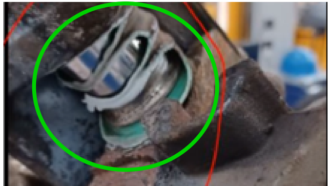
Traces of overheating