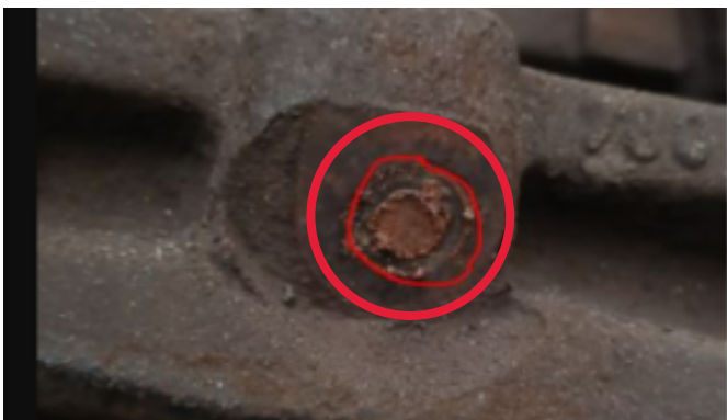
Cut screw (corrosion)