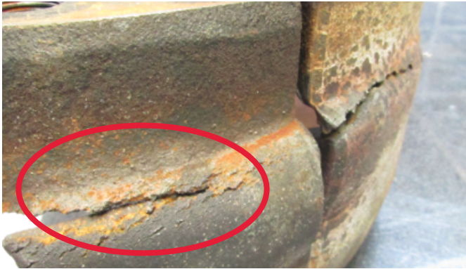
Cracked frame or carrier