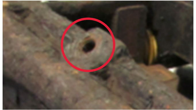
Pitting corrosion on frame (Not off-vehicle condition)