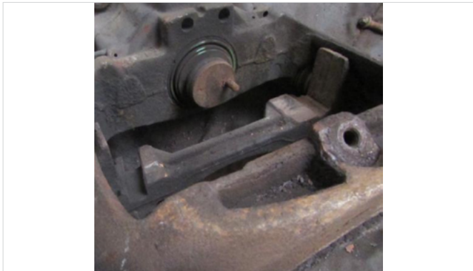
Surface corrosion which doesn't have impact on surface, no pitting allowed (carrier)