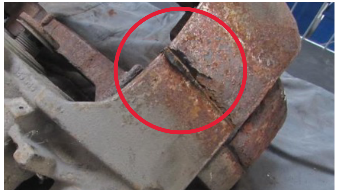
Cracked frame or carrier