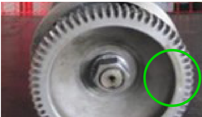
Scratches on the gear wheel