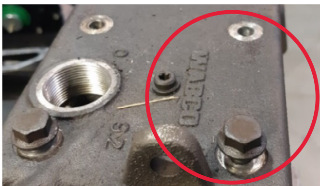
Not complete (partially disassembled) unit