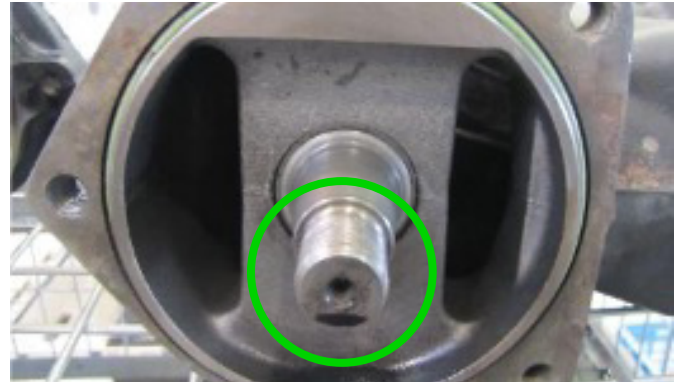
Missing wheel nut