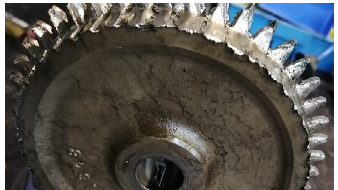
Deformation of the gear wheel