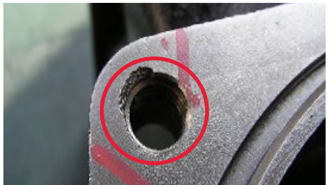
Deformed (damaged) thread/ thread hole