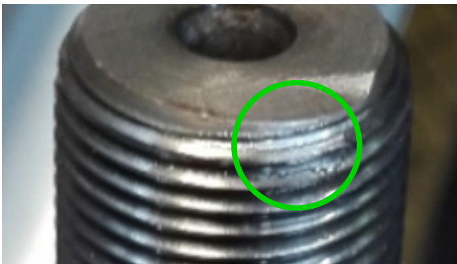
Light deformation of the front surface of crankshaft (thread not damaged)