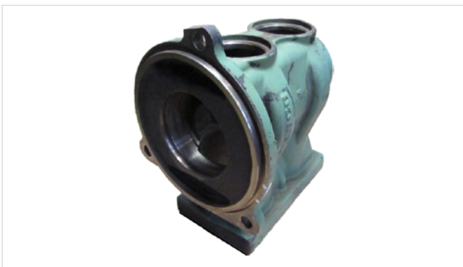
Scratches, paint on the crankcase