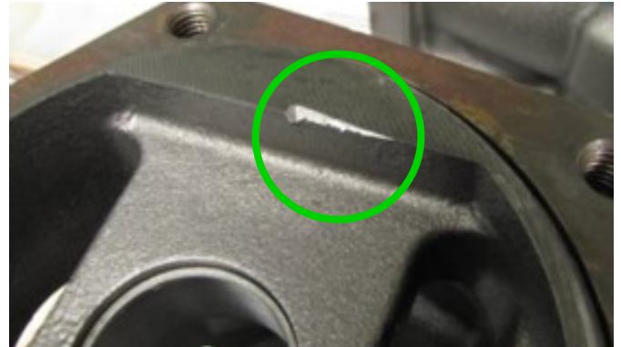
Signs of hit on external surfaces