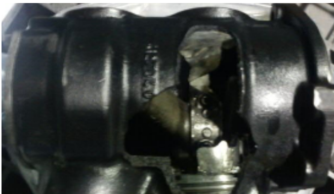
Damage of the device