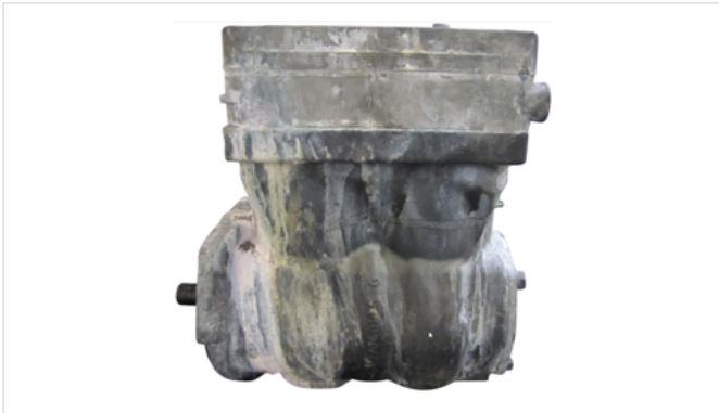
Surface corrosion and dirt - no impact on surface, no pitting allowed (crankcase)