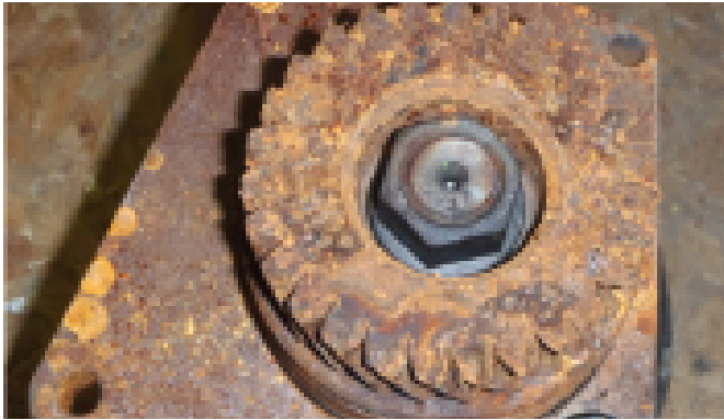
Heavy pitting corrosion (Not off-vehicle condition)