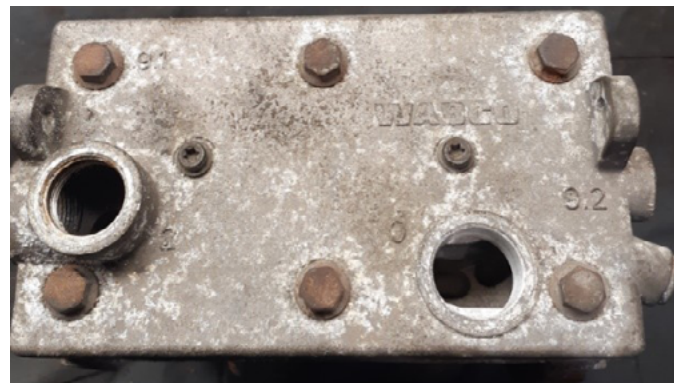
Scratches, paint on the cylinder head