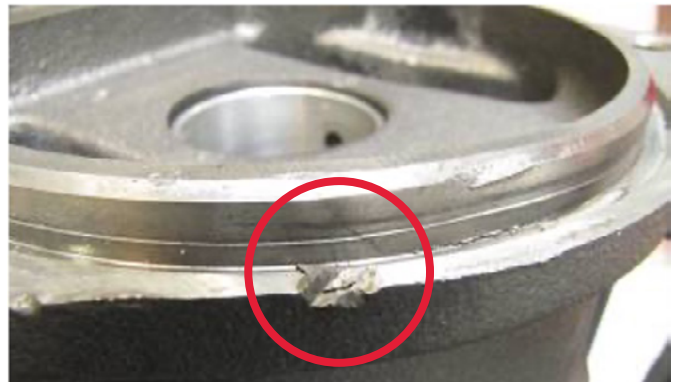
Sign of hit (damage on the crankcase sealing area)