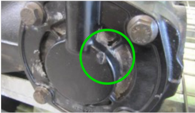
Broken or damaged Endcover