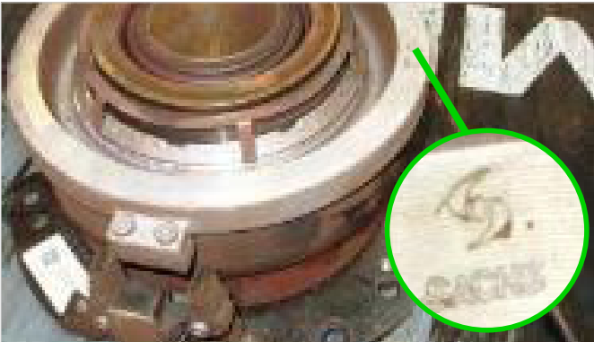
Brand must be legible on the part (see exemplary picture).