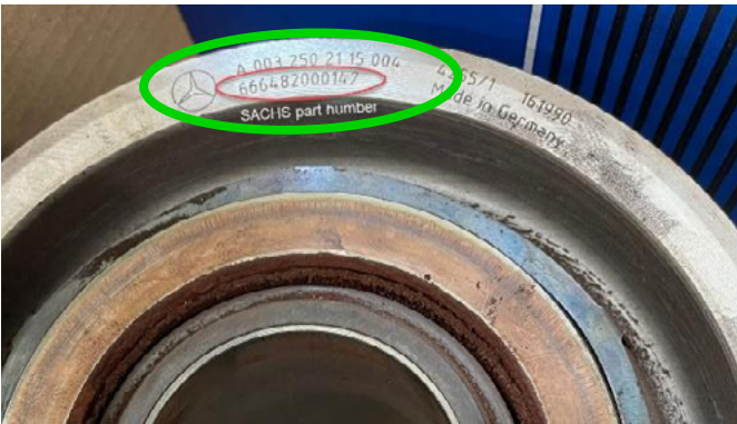
If no SACHS symbol, but SACHS OE - then it is acceptable as well.