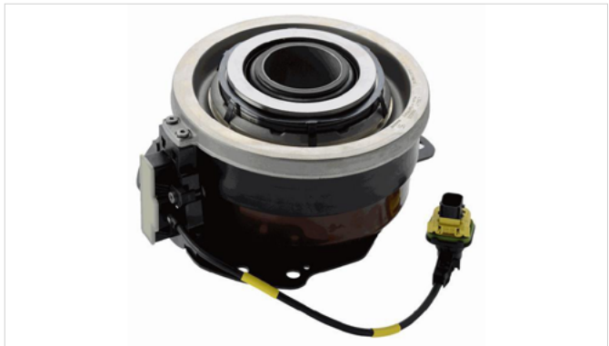
Part must be complete and not disassembled; Parts with missing sensor are accepted as well.