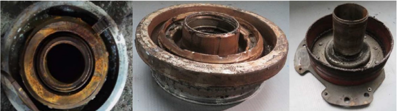
Surface corrosion and dirty